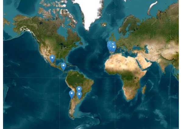
Partners and collaborative entities

All the information uploaded in project's website is available in English, Spanish and Portuguese. In addition, the Consortium guarantees the fulfillment of the requirements of the GDPR.